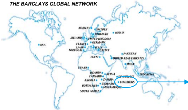
THE BARCLAYS GLOBAL NETWORK

THERE ARE MANY ADVANTAGES TO CONDUCTING BUSINESS IN MAURITIUS.